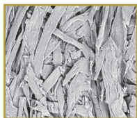
Paper Tape 250x magnification