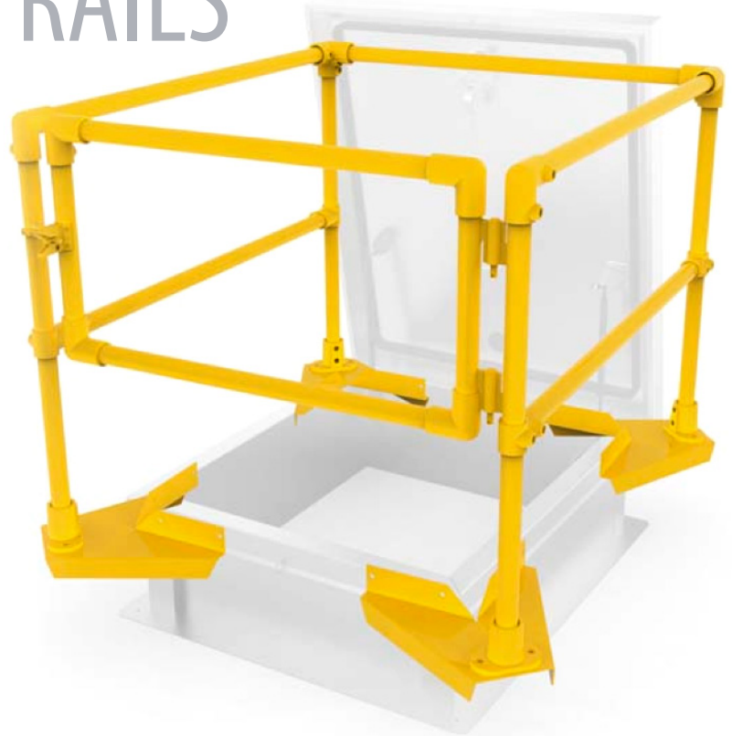
ROOF HATCH & SAFETY RAILS FRONT VIEW (ROOF HATCH COVER REMOVED FOR A BETTER VIEW OF THE RAIL SYSTEM)

For detailed specifications see submittal sheet